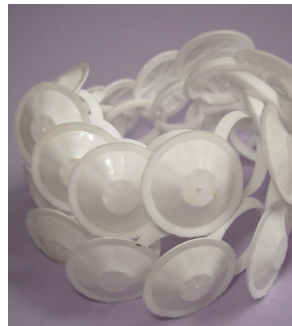
Milk Carton Pull Tabs