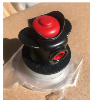
Boxed Wine Spout