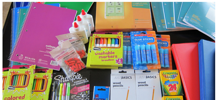
All School and Art Supplies