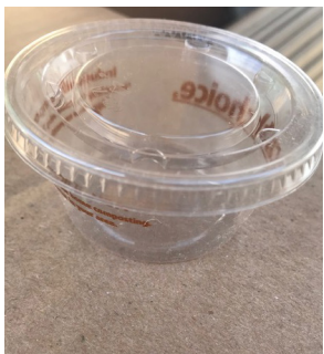
Plastic Containers + Tops