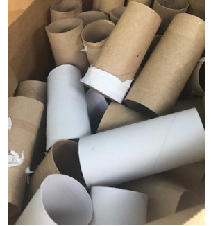
Paper Towel/Other Tubes