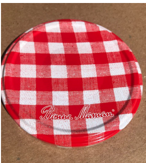
Red + White Jam Lid