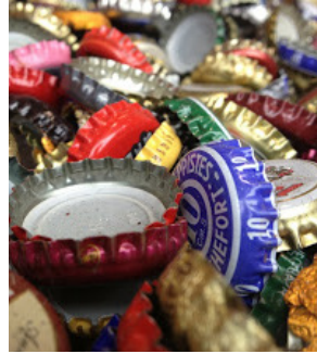
Metal Bottle Caps